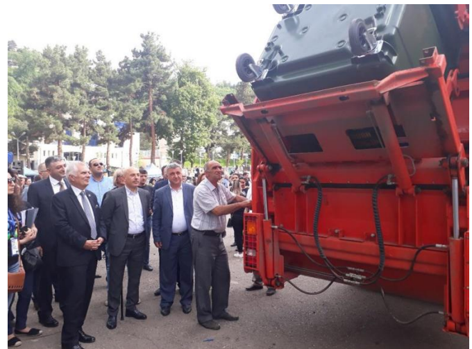
Kapan: A new garbage truck is removing the waste collected in a new bin

A great deal of capacity development has been carried out by the project that is resulting in highly effective waste management in three neighboring consolidated communities - Goris, Sisian, and Gorayk. Thanks to strong citizen mobilization and public education campaigns plastic waste separated and collected in partner communities is being sent to Kapan for recycling or sold (as in the case of Goris) for a lucrative price to replenish the budget for waste management.