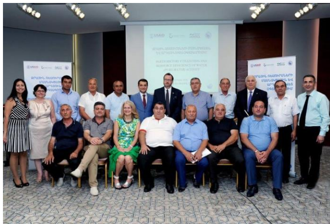
PURE Water partner communities

Through the 3-year USAID PURE Water project, the Urban Foundation led a sound intervention that contributed a lot to all stakeholders' behavior change in order to use decreasing groundwater resources more efficiently and productively. This has been done through intensive citizen participation, public education, sharing best practices by fisheries, drafting a number of laws in cooperation with decision-makers, helping water user associations and decision-makers to make water governance more transparent, using ICT tools, and improving drinking and irrigation water infrastructures.