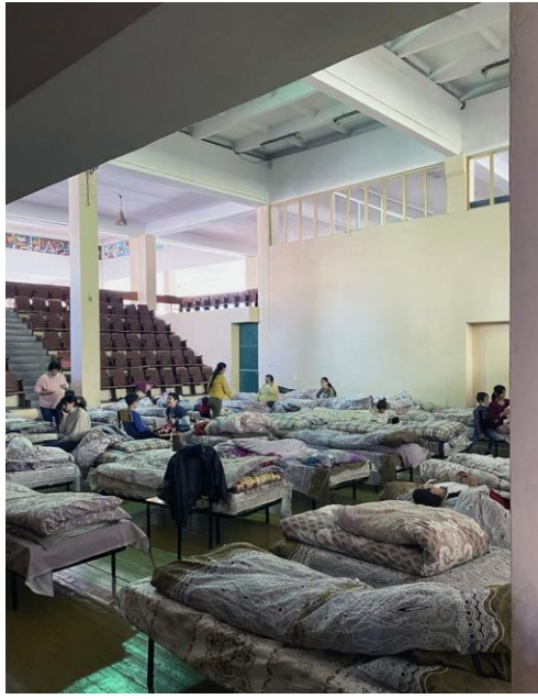
One of staging areas in Yerevan

The displaced households/persons have found refuge in various regions (marzes) of Armenia. According to the information provided by the RA MTAI<sup>40</sup>, the largest concentrations (75%) are in Kotayk, Ararat, Armavir and Syunik Regions. Official sources do not provide number of displaced persons currently residing in Yerevan, the capital, because according to them they do not have clear calculations. Based on expert interviews with Yerevan Municipality, around 45,000 displaced persons were estimated entering Yerevan at the early stages of displacement. Currently, the number is unknown because of fluidity (from Yerevan to other regions of Armenia and from Yerevan to Artsakh). They exactly know that currently they provide humanitarian assistance to around 10,000 displaced people (around 2,000 HHs.) In general, the RA Migration Services reported that there are cases of internal migration (around 800 displaced people moved from their initial regions in Armenian to another regions).